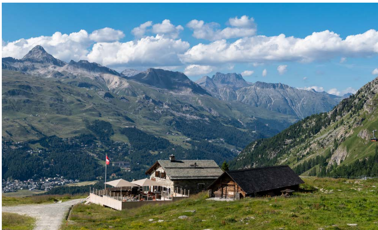
Fine lunches and “Marendas” – the Alpetta is also open in summer.

Corvatsch is home to the world’s highest whisky distillery ! Swiss whisky maker ORMA (Romansh for “soul”) has partnered with Corvatsch AG to offer a unique experience at 3,303 m above sea level. Guided tours and tasting sessions bring visitors closer to the liquid gold. Before or after sampling the whisky, visitors can enjoy an ORMA menu in Graubünden’s highest restaurant – Restaurant 3303. Guided tours take place on Wednesday, Friday and Saturday and can be booked in the Online Shop. For more information, go to www.ormawhisky.ch