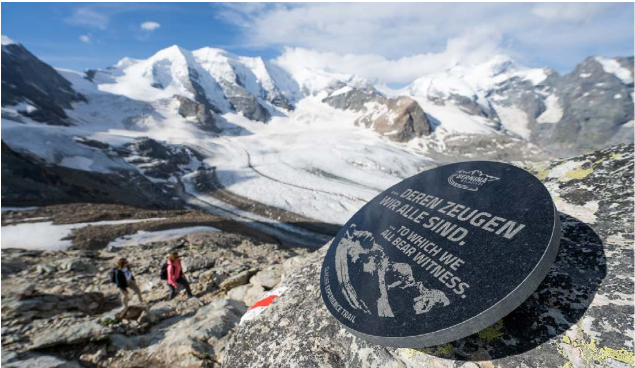
Glacier Experience Trail – a new hiking adventure.