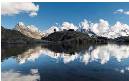
Corvatsch – Fuorcla Surlej.