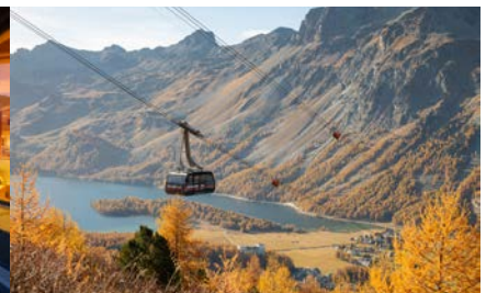
Furtschellas in autumn.