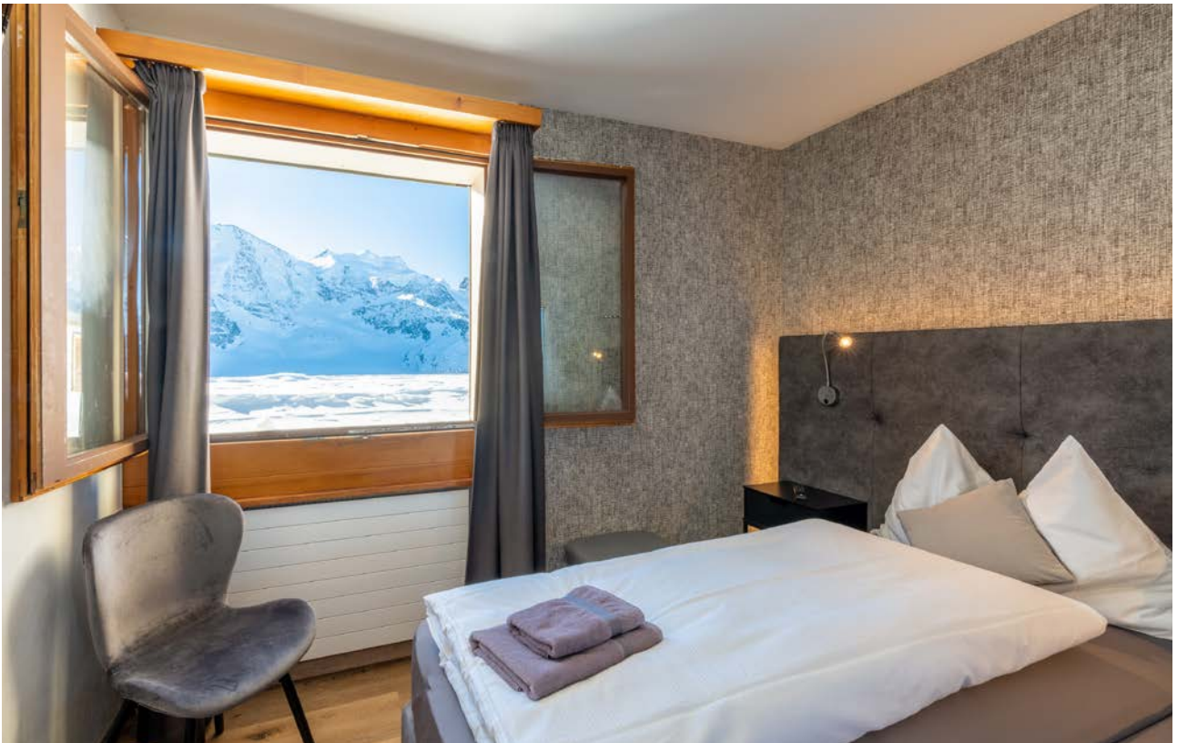
A double room at Berghaus Diavolezza.